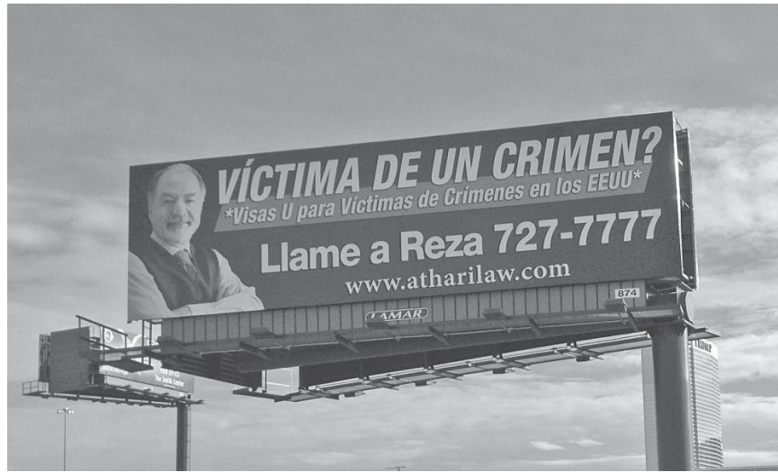
FIGURE 1: ATTORNEY BILLBOARD IN LAS VEGAS, NV, IN 2014, ADVERTISING “U VISAS FOR VICTIMS OF CRIME IN THE USA.”