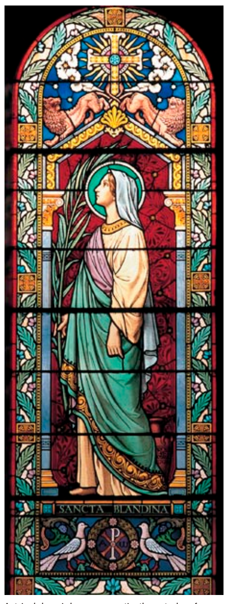
A stained glass window commemorating the martyrdom of Saint Blandina

But moral courage bears one telling requisite that in some domains distinguishes it from physical courage. Moral courage is lonely courage. Physical courage is no less courageous for having the support of comrades on the left and right in a shield wall, and when it must be carried out alone, it is all the more admirable. But moral courage loses no small part of its virtue when it is backed by a substantial support group. It takes little courage, moral or otherwise, for instance, to speak out against war or against Israel's policies in a university setting in the Western world.