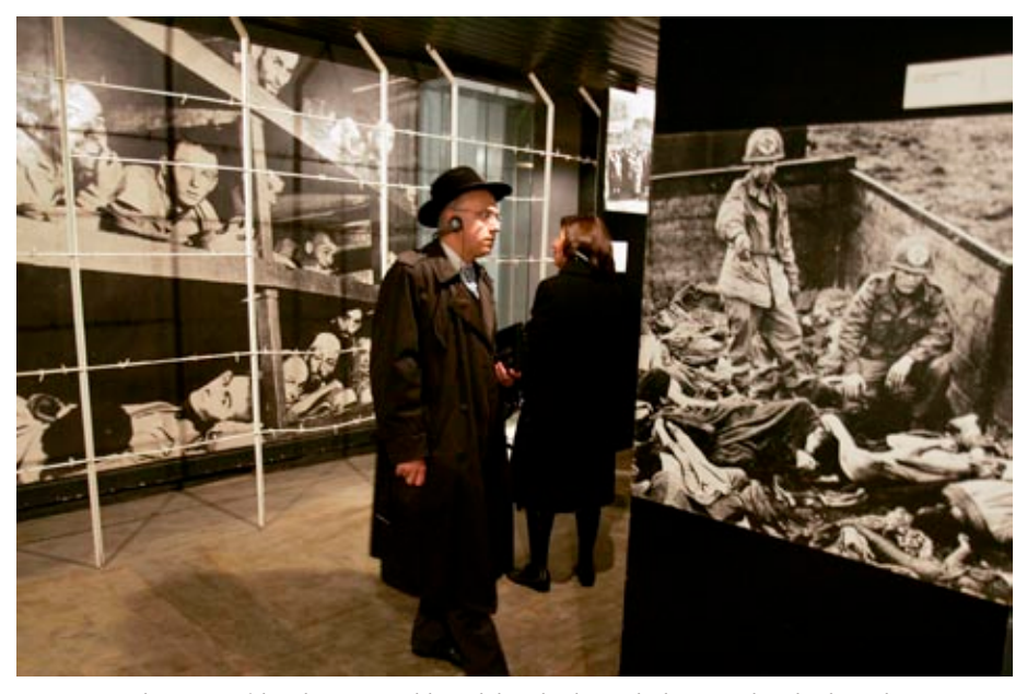
A visitor contemplates images of the Holocaust in an exhibition dedicated to the Nazi death camps at the Yad Vashem Holocaust Memorial's museum in Jerusalem. Israel

Needless to say, Plato's view is hardly disinterested; one detects the influence of the philosophers' lobby. Some of the braver