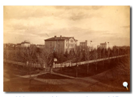
Old Law Building - in about 1865

The building contained the University Chapel until 1873 and University Library until 1883.