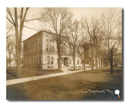
Old Law Building 1910/1918

Upon completion of Hutchins Hall in 1933, the Law Building was renamed Haven Hall and was used by Literature Science & the Arts. It burned down on June 6, 1950.