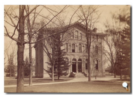
Old Law Building - 1863

The First Law Building, 1863-1933 The Law Department was founded in 1859 and graduated its first class in 1860, but not until 1863 did it have its own building, The Law Building (architects Jordan & Anderson) was southeast of the intersection of South State and North University.