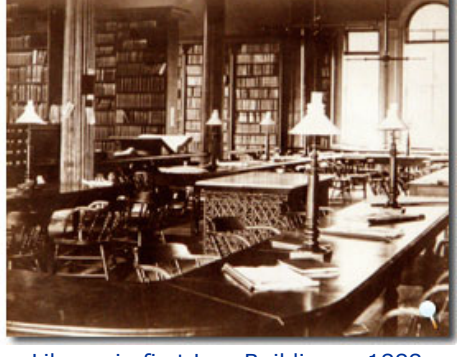
Library in first Law Building c. 1888

There is good light in this part of the room, and evidence that students have been using it although none are present. This 1888 photo must be the Law Library, since the University Library moved out in 1883. The bookshelves are quite full; inadequate library space has long been a problem for lawyers, since the library is the lawyer's laboratory.