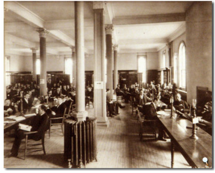
Law Library c. 1888

This is the Law Library in about 1888. Here we see many readers, and note the radiators wrapping around the columns, and very different style of lamp.