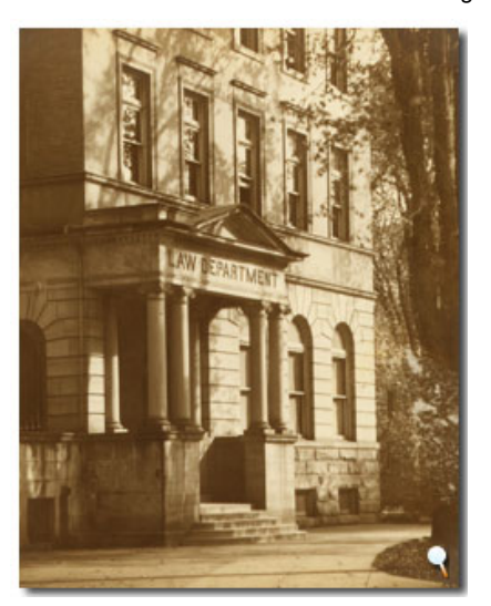
The Law Building in 1919, viewed from south.

The Law Building (Haven Hall) on October 16, 1922. Construction of the Lawyers Club had not yet begun. The area where the Law Building, and then Old Haven Hall were is now just grass and trees, north of Angell Hall.