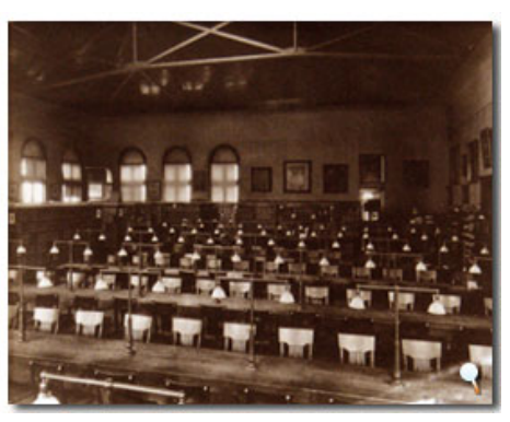
Classroom in first Law Building c. 1888