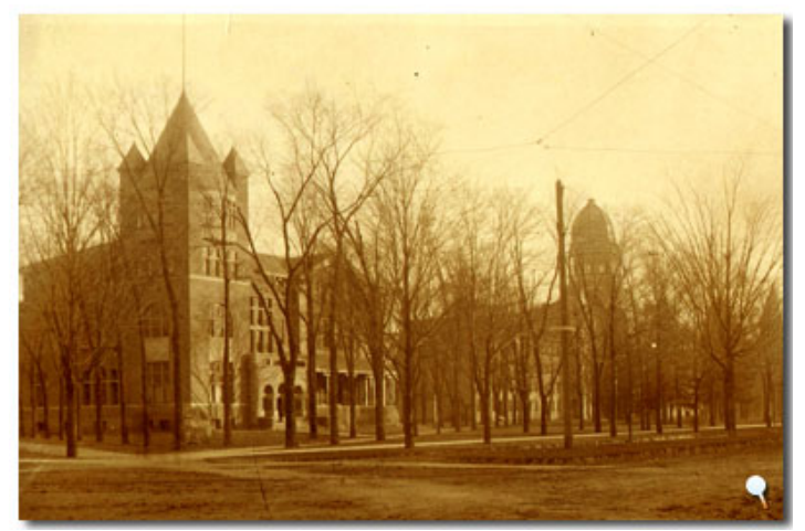
An addition in 1893 included a tower. This tower only lasted five years. It was removed, and the building expanded, in 1898.