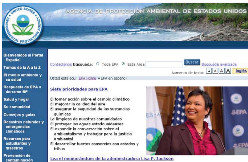
FIGURE 11: U.S. ENVTL. PROT. AGENCY WEBSITE IN SPANISH