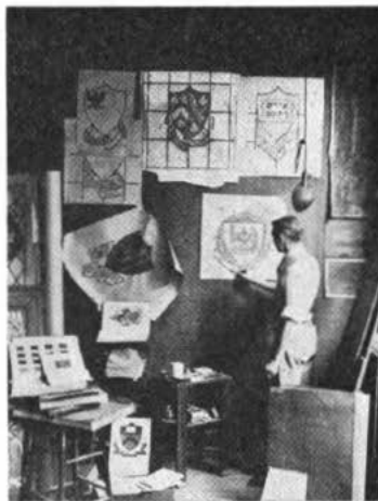
PRODUCING THE CARTOONS FROM MATERIAL RECEIVED FROM COLLEGES